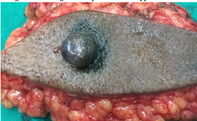
Figure 1: Showing excised specimen with nipple and areola.